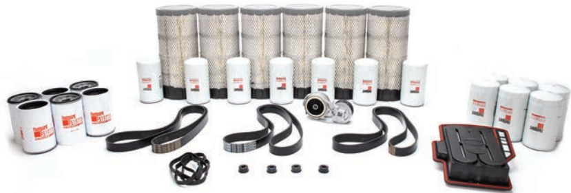
Pictured is the 60 kW prime/high-hour AMMPS maintenance kit. Refer to the table for details of all available kits.

With nearly 100 years partnering with the U.S. government and our knowledge of AMMPS army service cycles, our Cummins technical team has developed prime (high usage) and standby (low usage) maintenance kits for Cummins AMMPS generators from 5 kW to 60 kW.